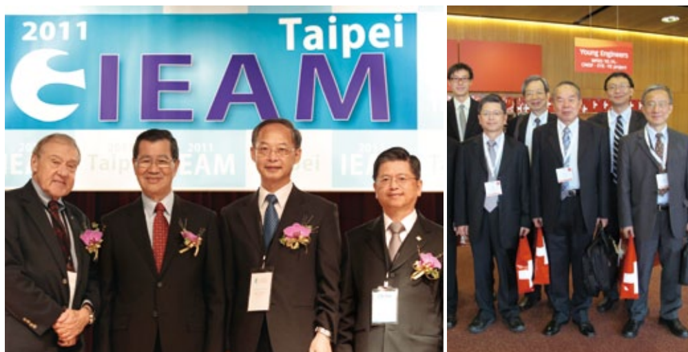
Achievements of Taiwanese NGOs in the International Arena: in Celebration of the Republic of China (Taiwan) Centennial