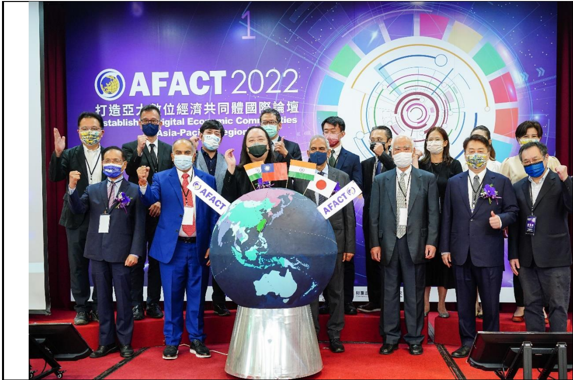
3. 計畫名稱：受補助(申請)單位/時間/地點/參加活動名稱 (表格請自行複製) AFAC 常設秘書處在臺啟動暨打造亞太數位經濟共同體國際論壇/財團法人商業發展研究院/2022年8月15日/臺大醫院國際會議中心/打造亞太數位經濟共同體國際論壇