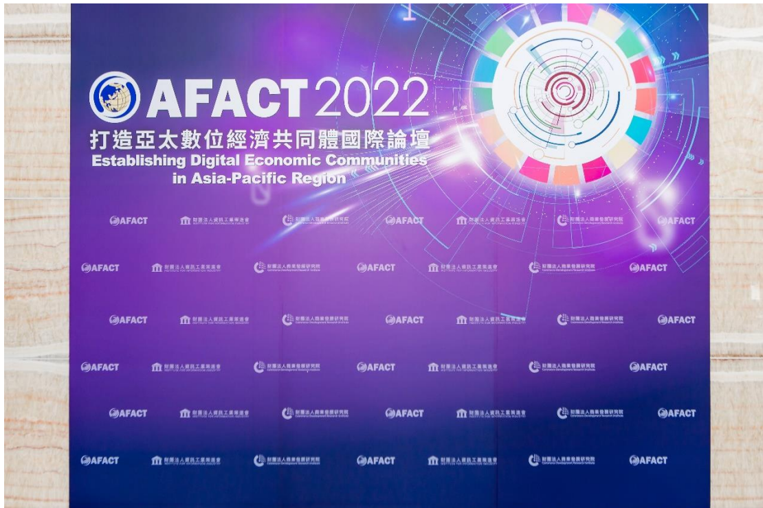
附件二：海報 1 件、