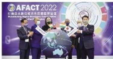
●實業部執行總長張政與 AFACT Hub (國家代表) (右一) 協理數位發展部副部長唐鳳(左三)，與 15 日 AFACT 打鐵趁熱數位經貿交流論壇開幕禮 AFACT 常設秘書處與專家們共同開幕。

《UN/CEFACT》聯合國際標準化與電子商務中心，以促進國際電子商務發展，並由印太區域數位經貿交流論壇數位經貿交流論壇主辦國推選，更是公認全球數位經貿與國際標準發展的重要組織之一。目前是在數位經貿交流論壇常務委員會下一位輪值主辦國，成員包括歐洲各國與國際貿易組織及各產業領域之專家與領導，全球約有 500 位專家代表參與。